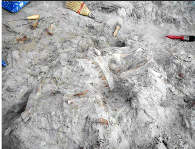
FIGURE 1. An exact replica of the skeleton of the theropod dinosaur Majungatholus atopus from the Late Cretaceous of Madagascar (above), based on a composite of specimens, and the excavation site from which one of the specimens was recovered (below).

tionships of major groups of Gondwanan vertebrate animals. The Jurassic of Madagascar has yielded the earliest known record of tribosphenic mammals, a discovery that has played a strong role in shaping views of early mammalian evolution. For some parts of the fossil record, we already know that Madagascar provides unparalleled insight into ancient animal life because these time intervals are poorly represented elsewhere in the world. For example, at the beginning of the Triassic, a diverse array of archaic vertebrate animals populated the globe. By the end of the period, dinosaurs and mammals had appeared but the record of what transpired in between has been sparse on all continents, and is only now beginning to be revealed by discoveries from Madagascar. The Malagasy fossil record also yields profound insight into the biogeographic origins of the extant fauna of Madagascar, both recent and long past extinction patterns (including lessons to be learned concerning maintenance of the modern biodiversity), and the timing, sequence, and environmental and biotic effects of Gondwanan fragmentation.